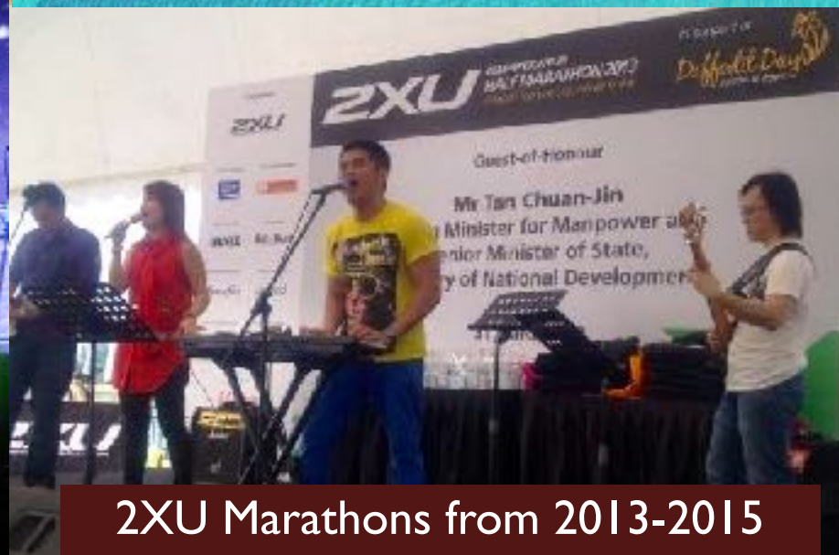
2XU Marathons from 2013-2015