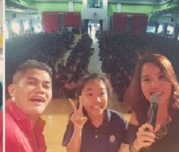
Assembly Performance at Kuo Chuan Presbyterian Secondary School, 2017