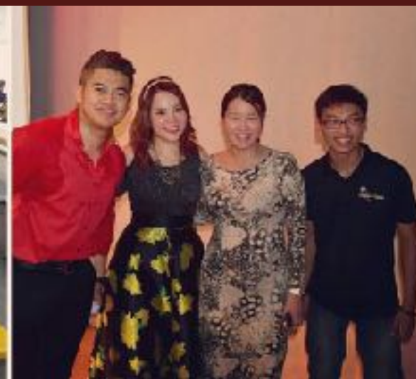
NDP Performance at Juying Primary School, 2016