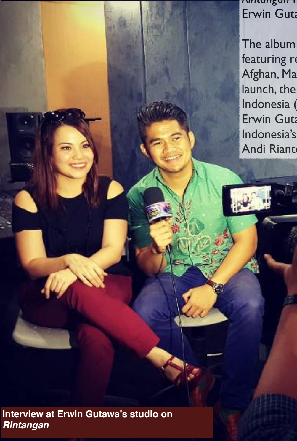
Interview at Erwin Gutawa's studio on Rintangan

The album was launched on 3 March 2018 at the Java Jazz 2018, featuring renowned artistes like Sheila Majid, Glenn Fredly, Tulus, Afgan, Maliq & D'Essentials, Fariz RM, Andien and more. Since its launch, the album won "Best Album Award" at the Anugerah Muzik Indonesia (most prestigious music award in Indonesia). Besides Erwin Gutawa, the tracks in the album were arranged by other Indonesia's top arrangers Addie MS, Yovie Widiyanto, Tohpati dan Andi Rianto.