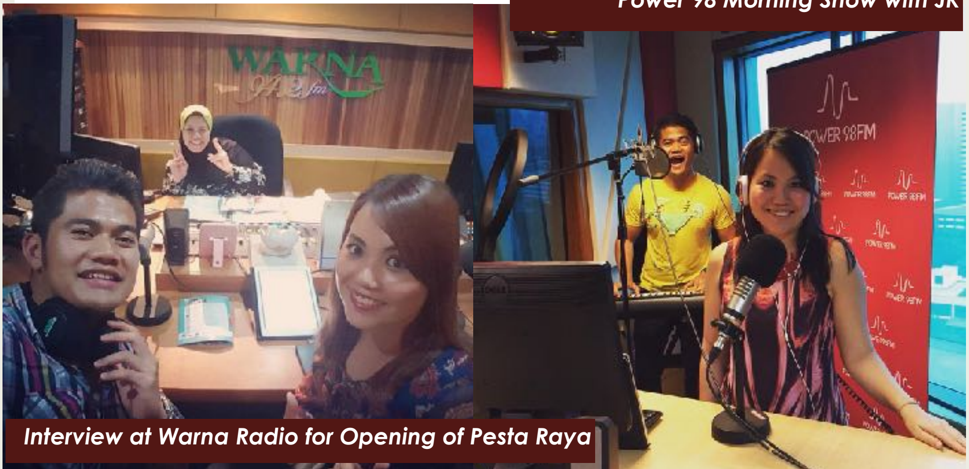
Interview at Warna Radio for Opening of Pesta Raya