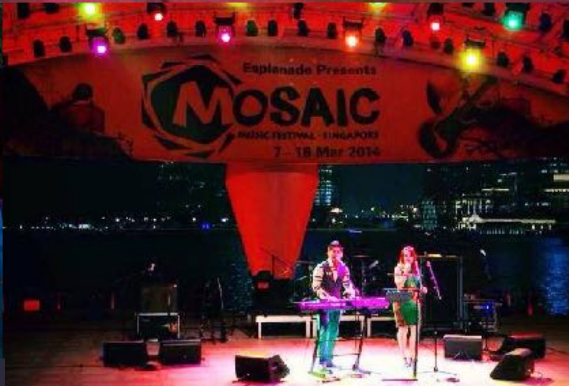
Singapore Mosaic Festival, 2014