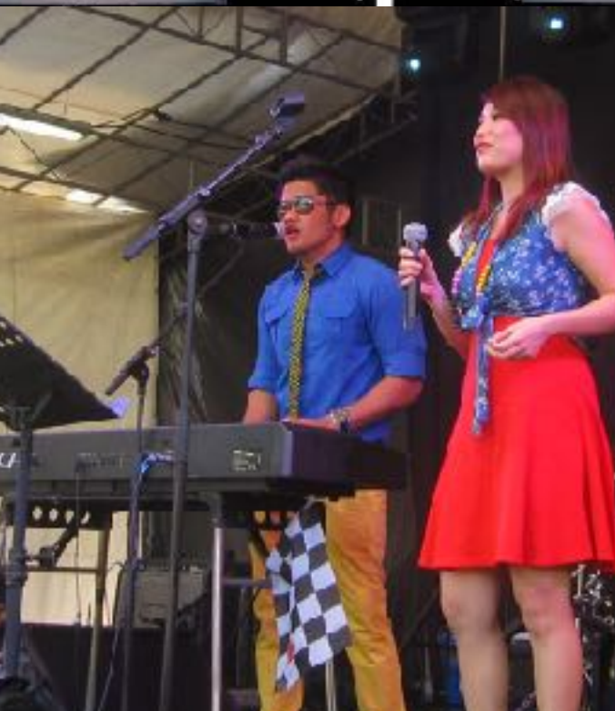
Esplanade Park Stage@F1 SGP 2013