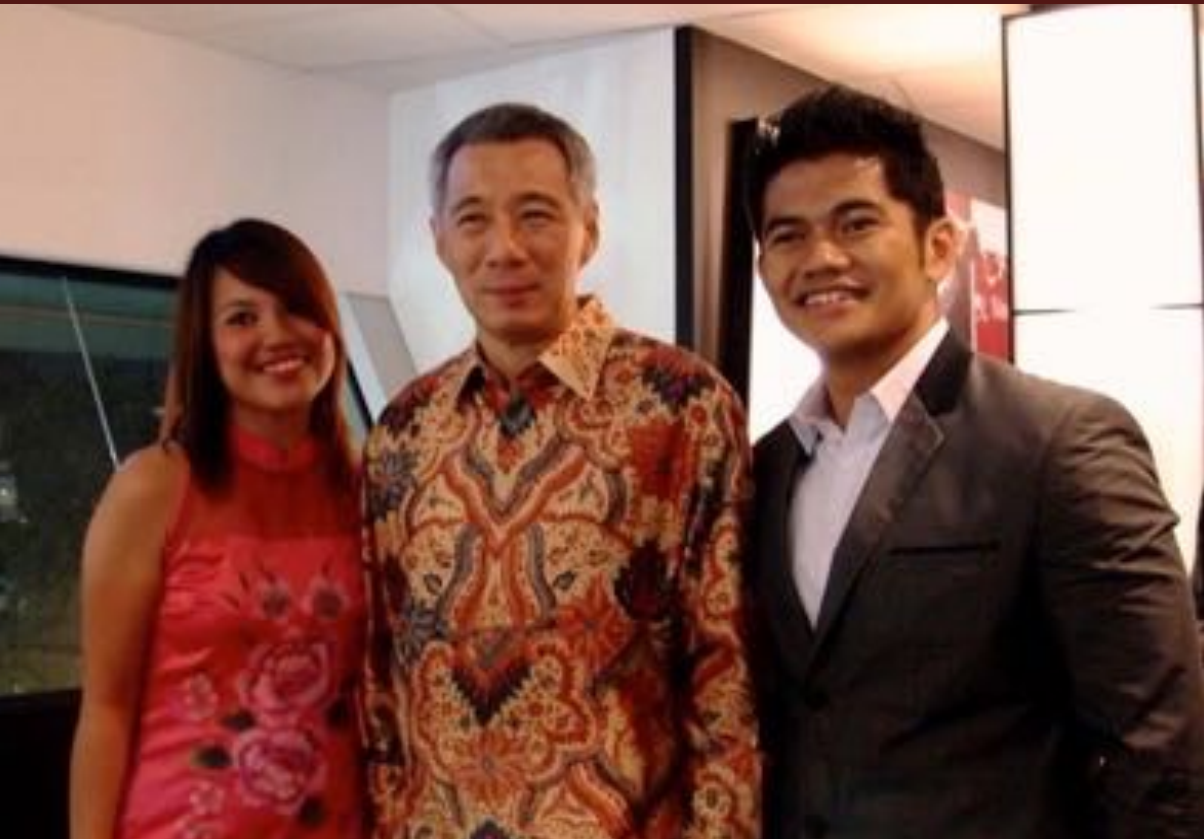
With PM Lee and President Dr Tony Tan at FI Singapore Grand Prix 2012 at Temasek Suite