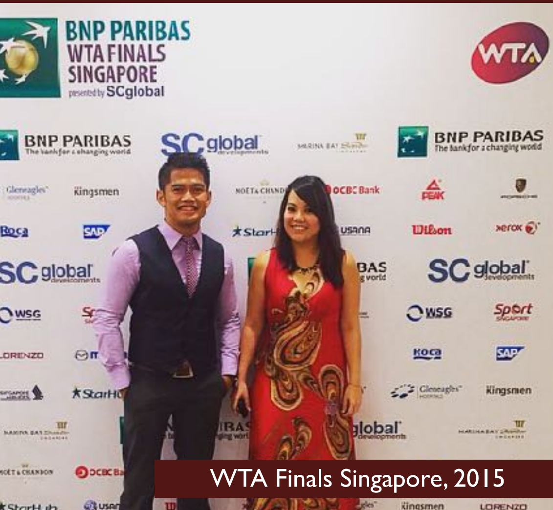
WTA Finals Singapore, 2015