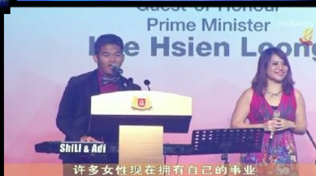
Women's Executive Committee of People's Association (WEC) Gala Lunch (Channel 8)