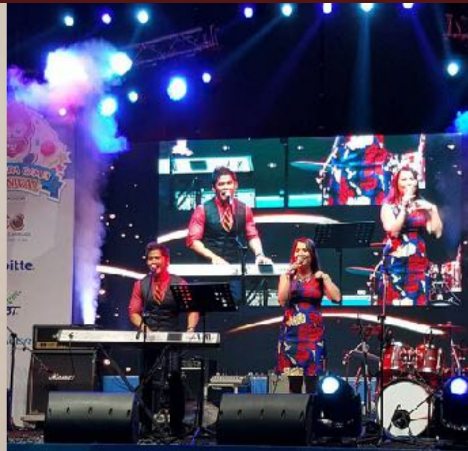
ASEAN Para Games 2015@Sports Hub