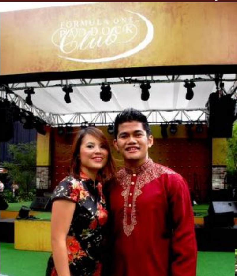
Paddock Club Stage@F1 SGP 2012