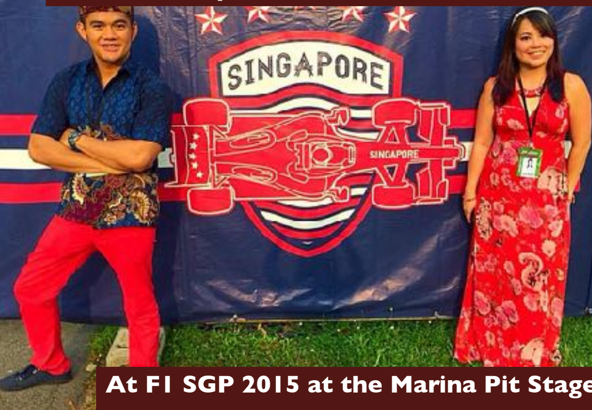
At FI SGP 2015 at the Marina Pit Stage