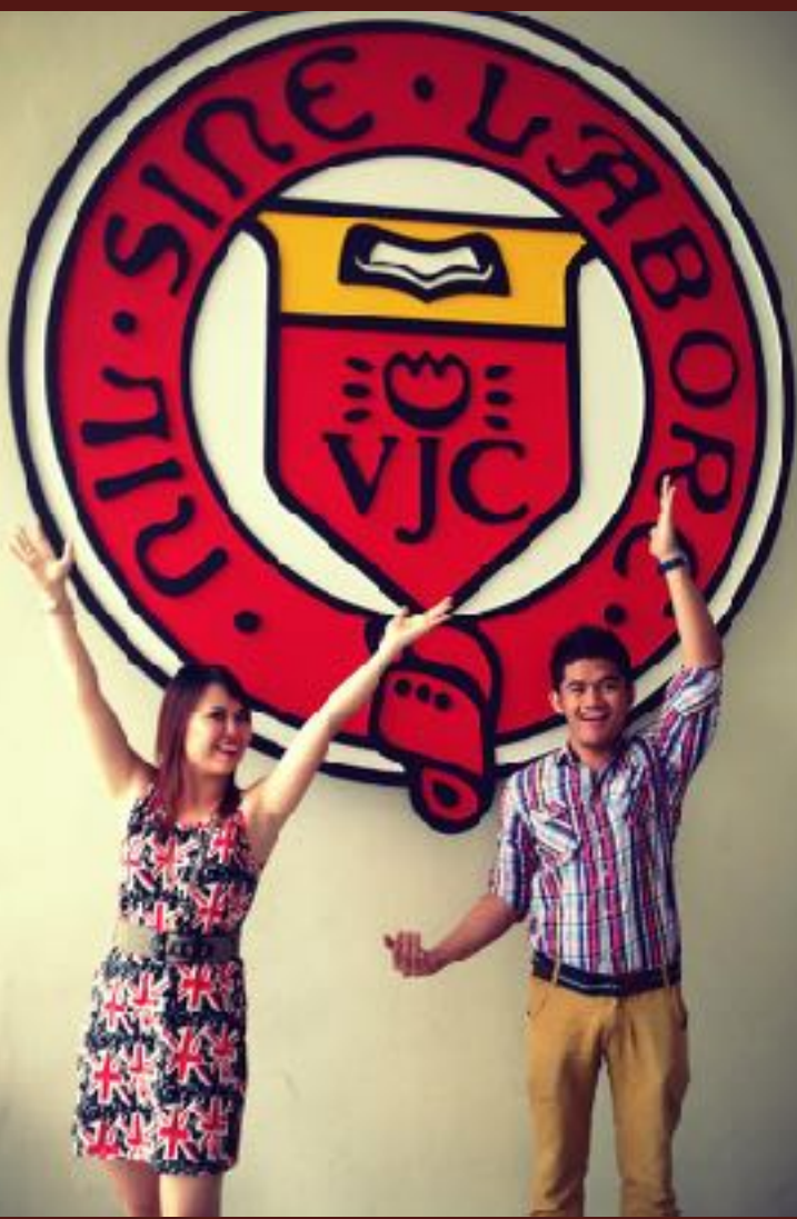
Judges at Victoria Junior College's Music Festival, 2015