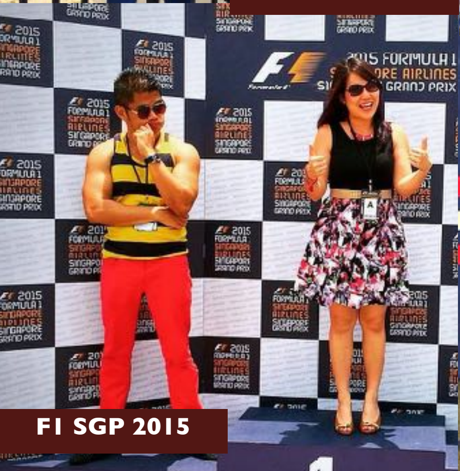
FI SGP 2015