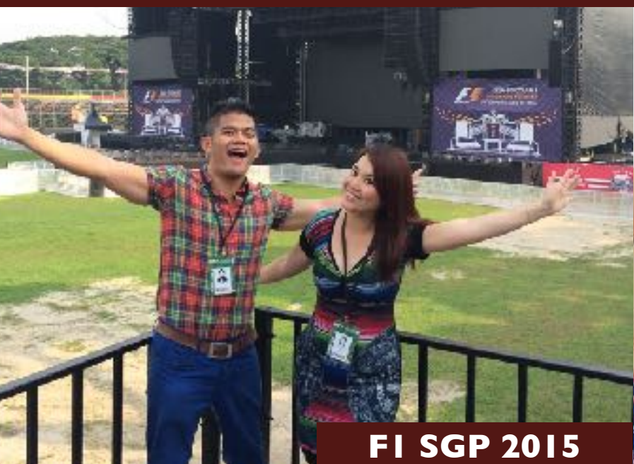
FI SGP 2015