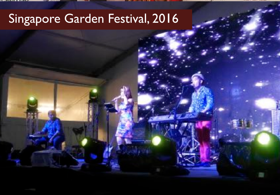
Singapore Garden Festival, 2016