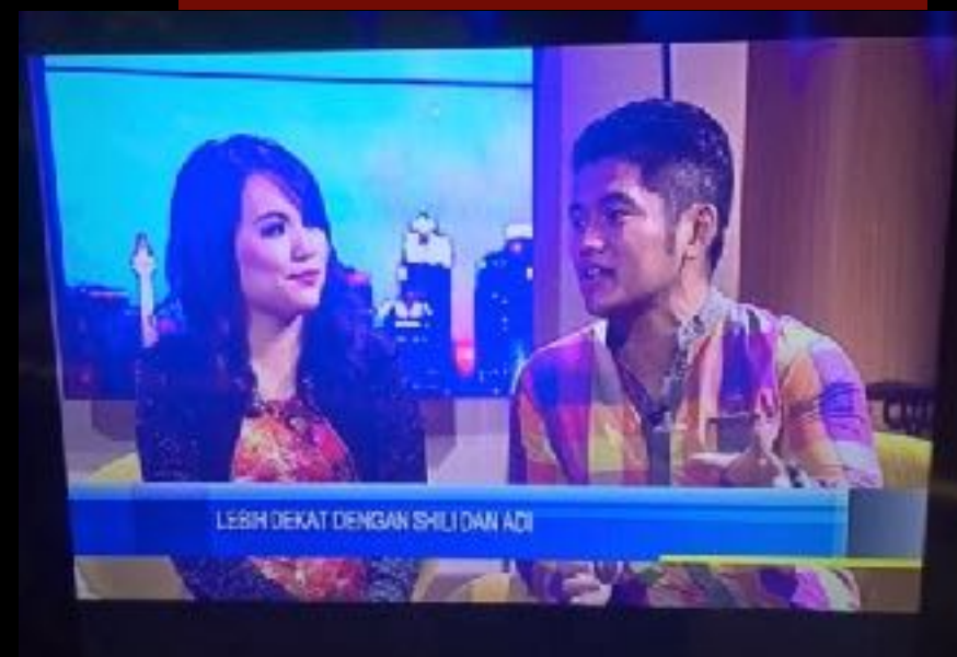
Jawa Pos TV, Jakarta 2017