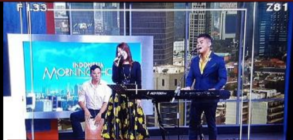
Indonesia Morning Show (NET TV), 2017