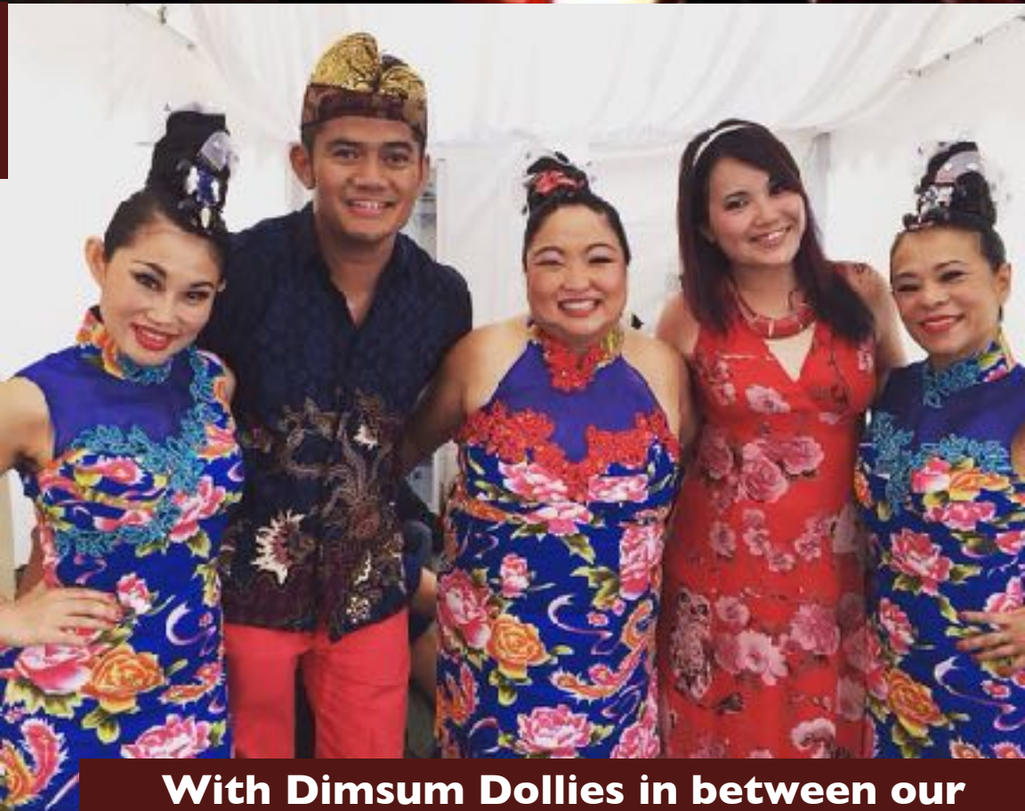
With Dimsum Dollies in between our performance sets