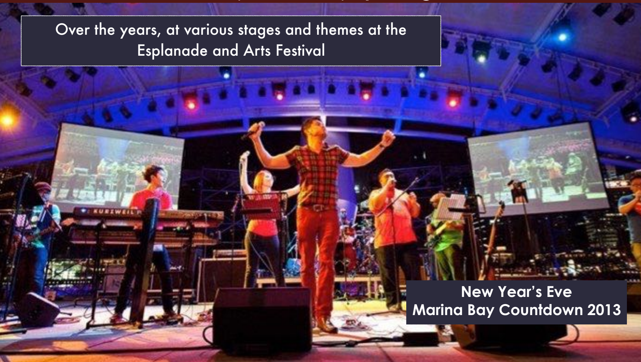
New Year's Eve Marina Bay Countdown 2013

Over the years, at various stages and themes at the Esplanade and Arts Festival