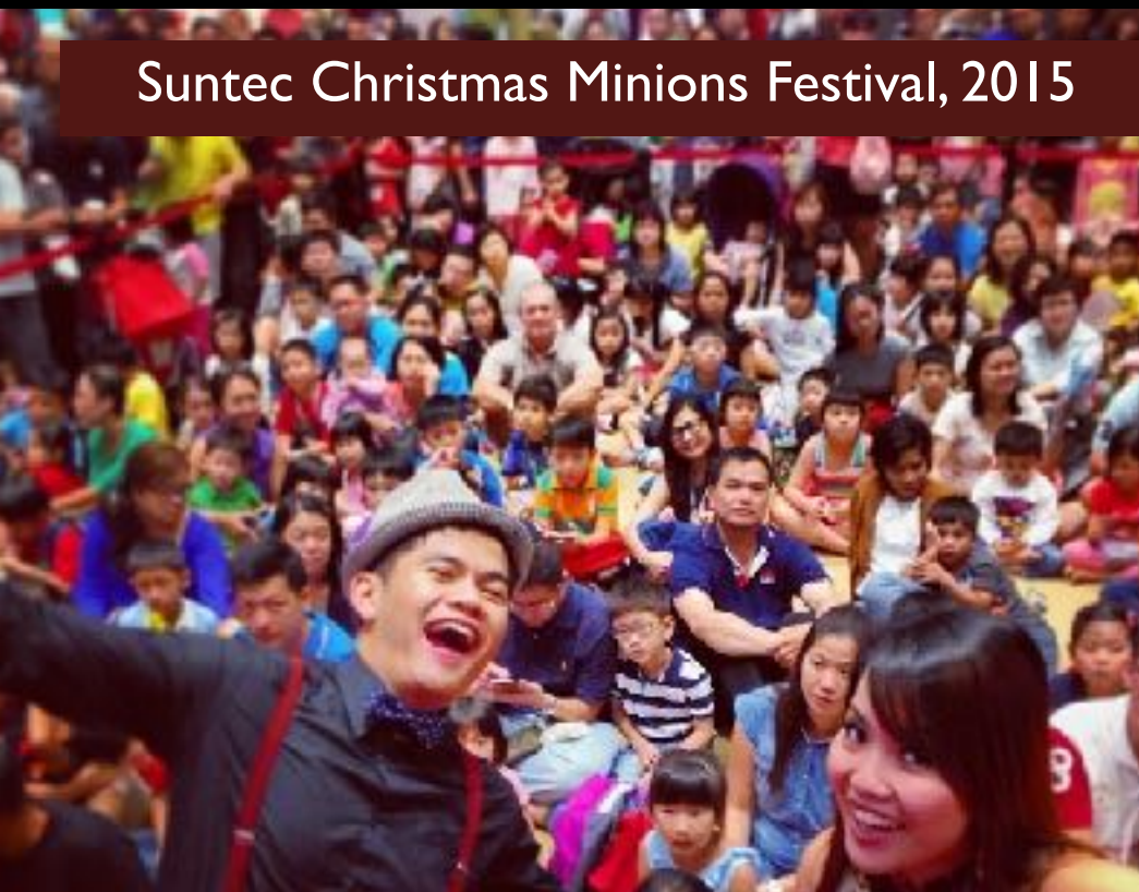
Suntec Christmas Minions Festival, 2015