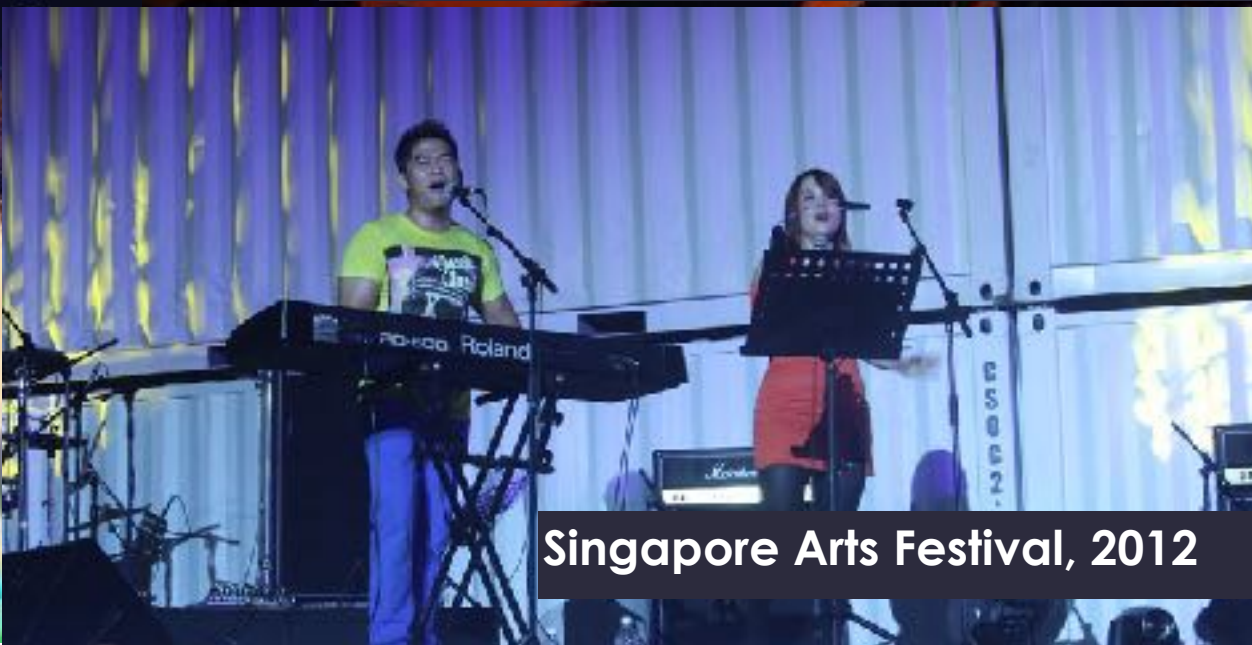
Singapore Arts Festival, 2012