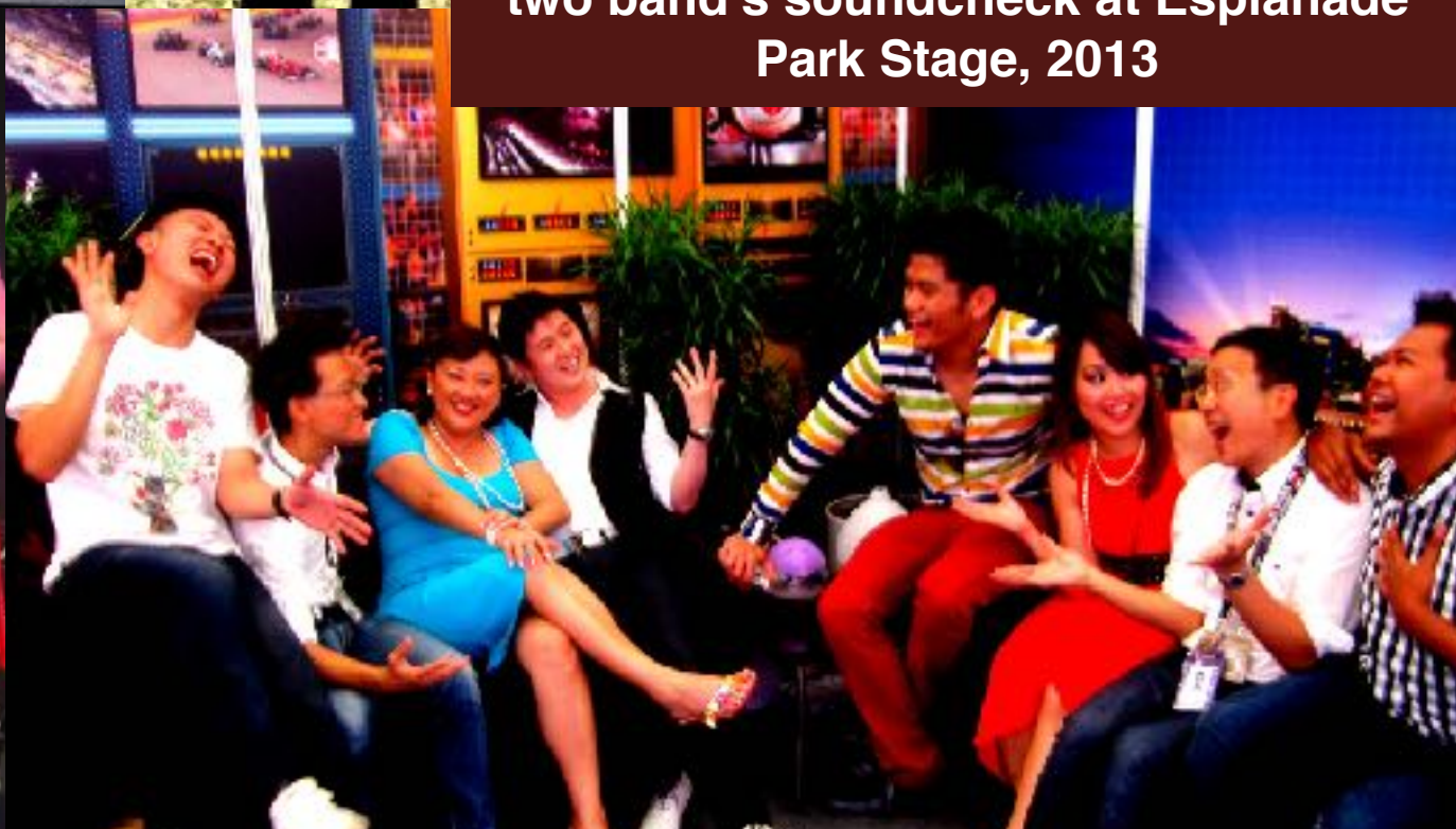
With acappella group, Vocaluptous