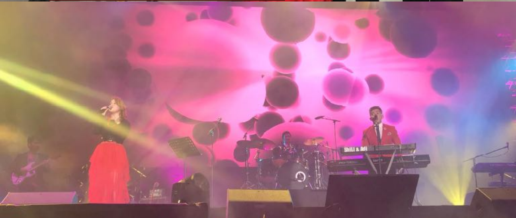
In WTA Finals (Singapore) 2018, ShiLi & Adi were handpicked by WTA and UnUsual Entertainment to open for Wakin Chau (周华健) performing popular hits and their original song 原来是你 to 20,000 people at the Singapore National