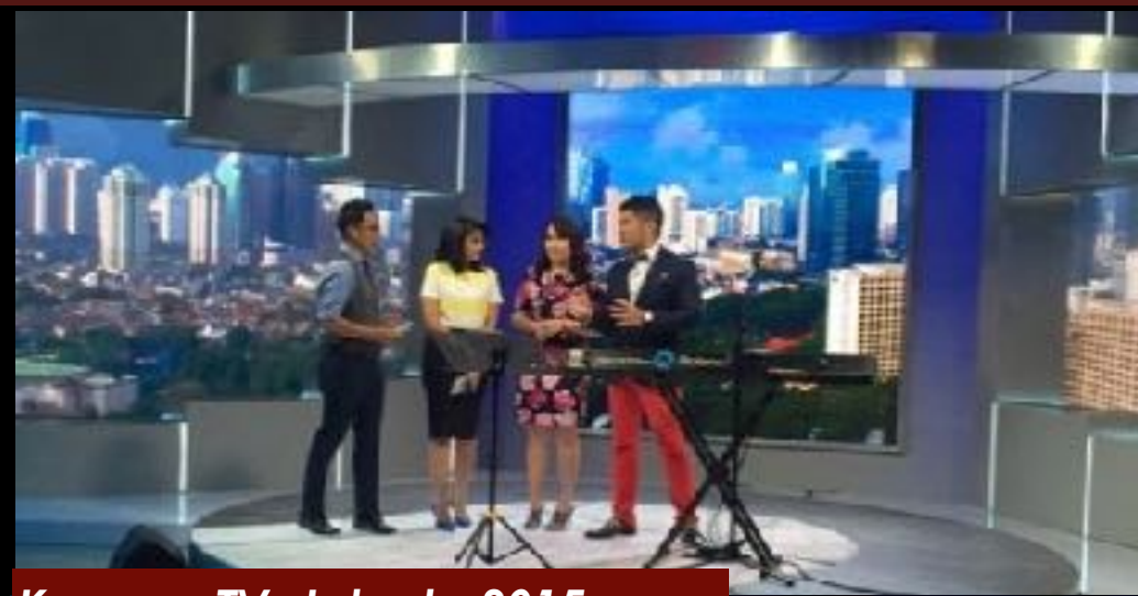
Kompas TV, Jakarta 2015