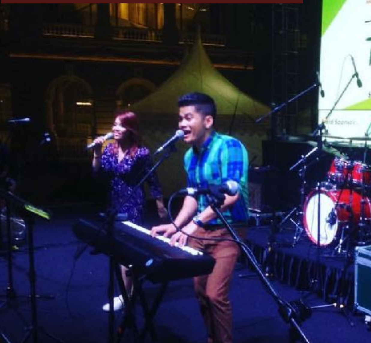
Nparks Concert Series in the Park, 2016